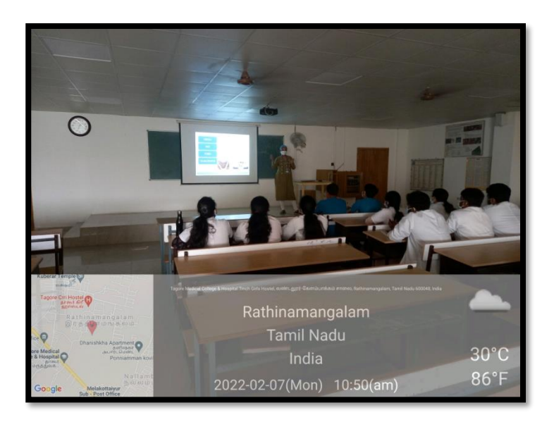
Lecture on OPG