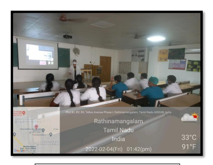
Lecture on Projection Geometry