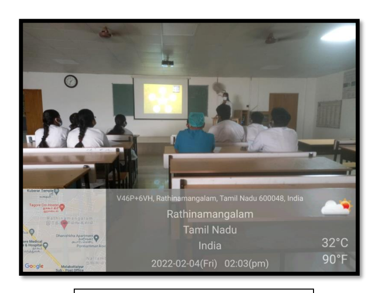
Lecture on Intra Oral Anatomical Landmarks